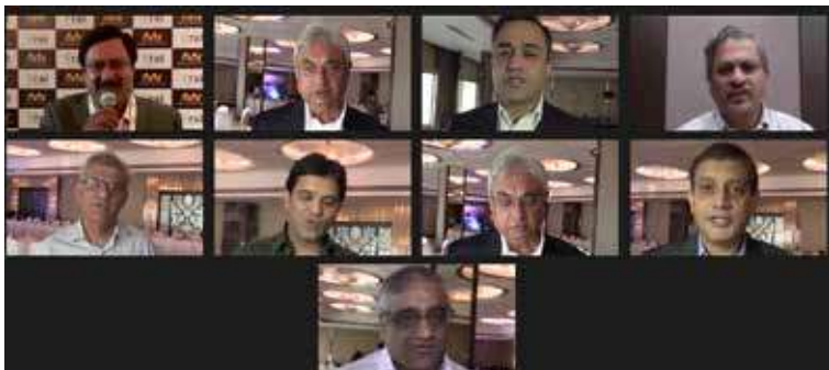
Top Retail CEO's share their RED message.